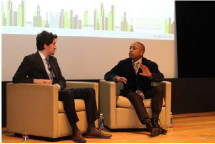
Daymond John at ICCC NYC