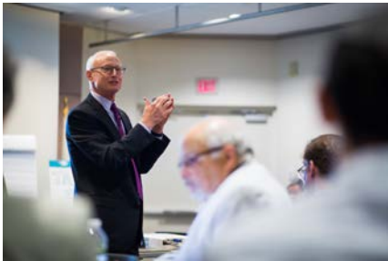
Professor Michael E. Porter at ICCC Boston