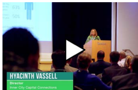
Inner City Capital Connections Sizzlr Video