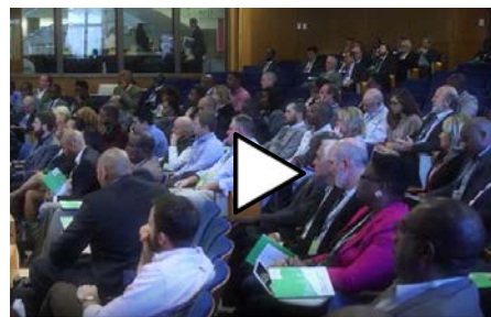
ICCC St. Louis 2016