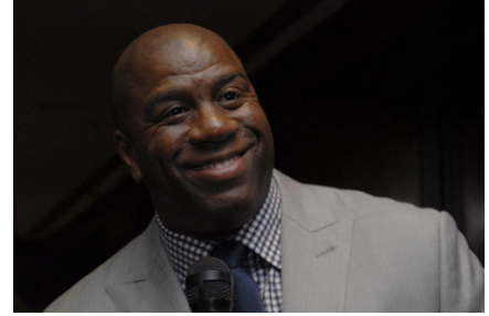
Magic Johnson at ICCC Los Angeles