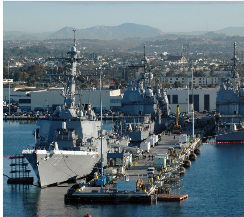
Naval Station San Diego

San Diego is home to the largest concentration of U.S. military assets in the world. 8 The military and defense sector accounts for more than 22 percent of San Diego's GDP. 9 There are numerous organizations within San Diego and San Diego County, including the San Diego Regional Economic Development Corporation and the San Diego Association of Governments, that actively support the growth of the very large defense cluster. SDRIC plays a relatively narrow, but important, role in supporting small businesses within C4ISR (command, control, communications, computers, intelligence, surveillance, and reconnaissance), cybersecurity, and autonomous systems.