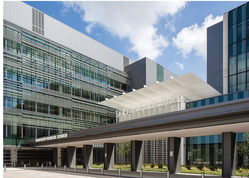
University Medical Center, New Orleans BioDistrict (Image courtesy of NBBJ)

NOLABA is also responsible for leading the implementation of ProsperityNOLA , and the plan guides the organization's activities. An independent 501(c)(3), NOLABA operates as a public-private partnership and is led by an 17-member board, composed of a cross section of