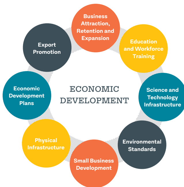
Figure 1. A Strategic Cluster Framework

A cluster includes closely related and interconnected industries operating within a specific geography. The companies operating within a cluster are connected by a shared workforce, supply chain, customers or technologies. Every cluster includes core businesses and industries, and the companies that support them, which forms a mutually beneficial business ecosystem. Clusters occur organically and reflect the unique assets and core competencies of a given region that create unique competitive advantages for certain industries.