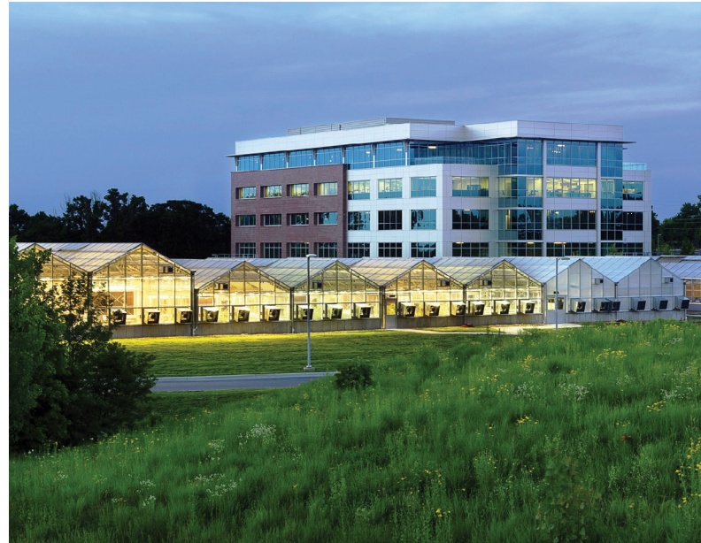
BioResearch & Development Growth Park and the Plant Growth Facility at the Donald Danforth Plant Science Center

Compared to the defense cluster in San Diego, the bioscience cluster in St. Louis is relatively small and BioSTL has the capacity to drive its growth through a broad coalition of partners. Part of the cluster initiative's success is due to this ability to coordinate all cluster partners through a shared objective.